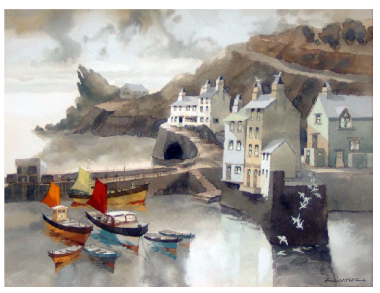
Frederick Cook, 'Inner harbour, grey day'

suitable space, not only for the exhibition but also for the safe storage of the pictures not currently on display. The village hall and the Rowett Institute are possible candidates. In either case, some minor construction work might be needed; but the exhibition space could still be available for any activities that would not put the paintings at risk such as meetings, social gatherings, talks, yoga classes and almost anything except ball games. In its initial discussions the Community Council has been supportive and possible sources of grant funding can be explored.